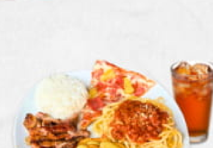
LUNCH COMBO B Grilled Pork Belly in Teriyaki Sauce, Rice, Potato Jojos, Spaghetti Bolognese or Carbonara, Slice of Pepperoni or Hawaiian Pizza, Iced Tea or Iced Coffee