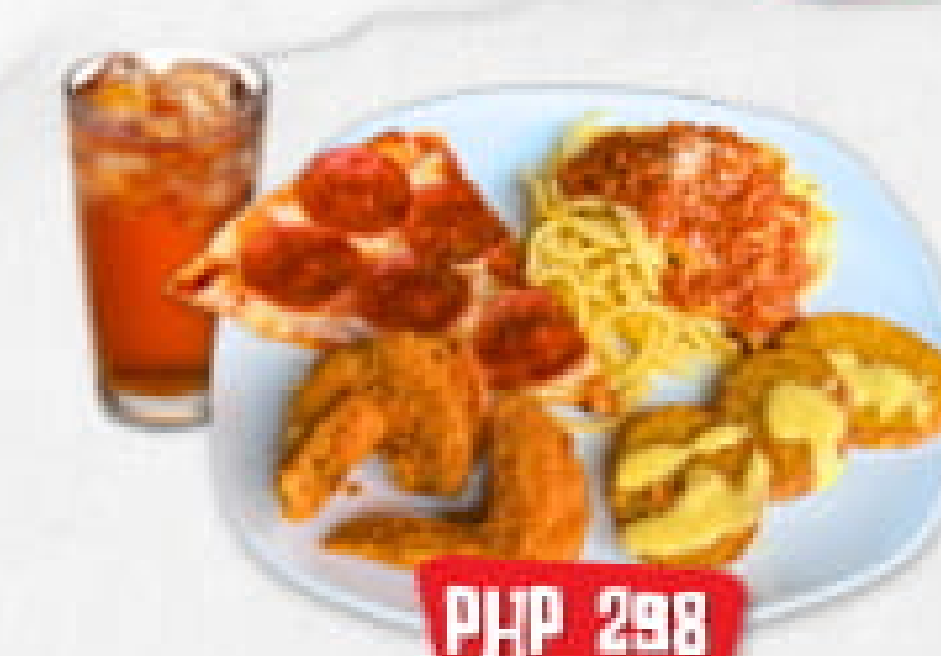
LUNCH COMBO A Fried Chicken, Potato Jojos, Spaghetti Bolognese or Carbonara, Slice of Pepperoni or Hawaiian Pizza, Iced Tea or Iced Coffee

Serving time is 15-25 minutes. Prices inclusive of VAT, no service charge, and may change without prior notice.