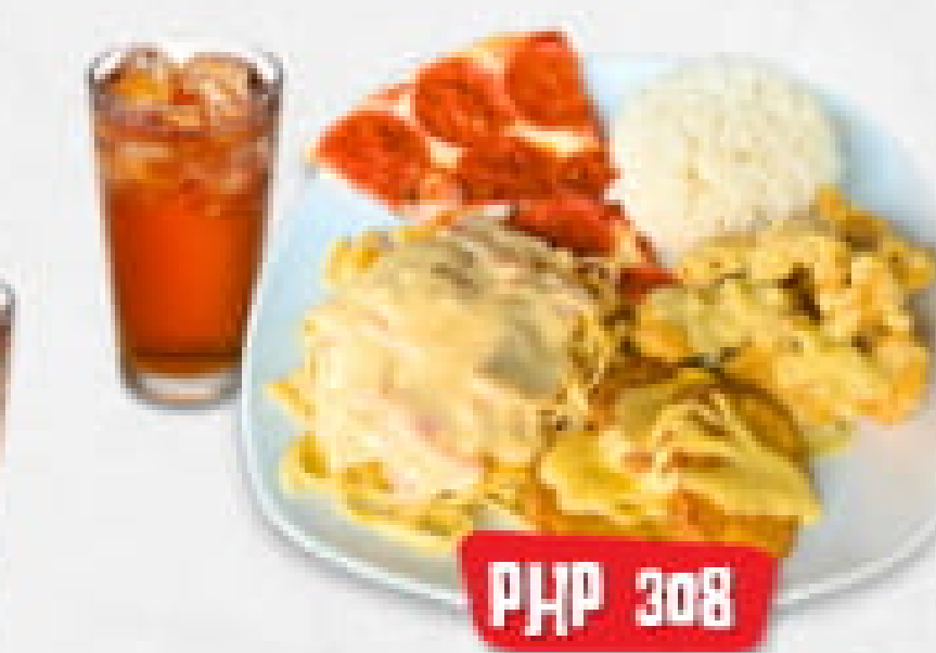
LUNCH COMBO C Fish Fillet in White Basil Sauce, Rice, Potato Jojos, Spaghetti Bolognese or Carbonara, Slice of Pepperoni or Hawaiian Pizza, Iced Tea or Iced Coffee